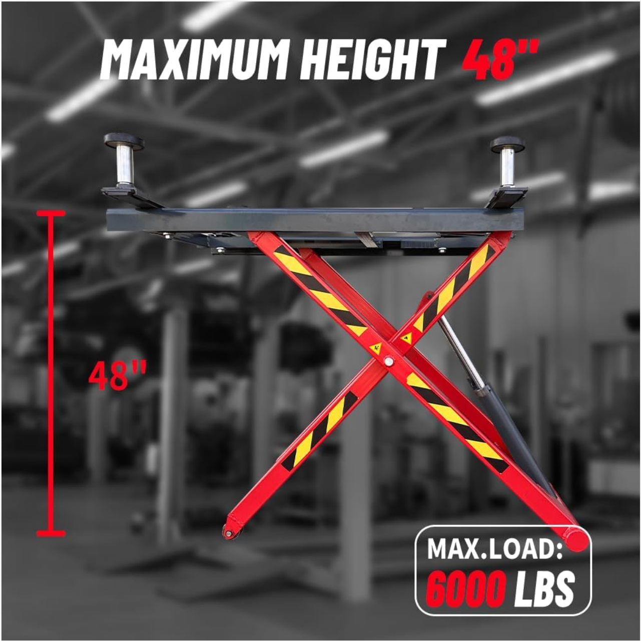
Figure 4.1: The KATOOL AK-X66 Scissor Lift demonstrating its maximum lifting height of 48 inches.