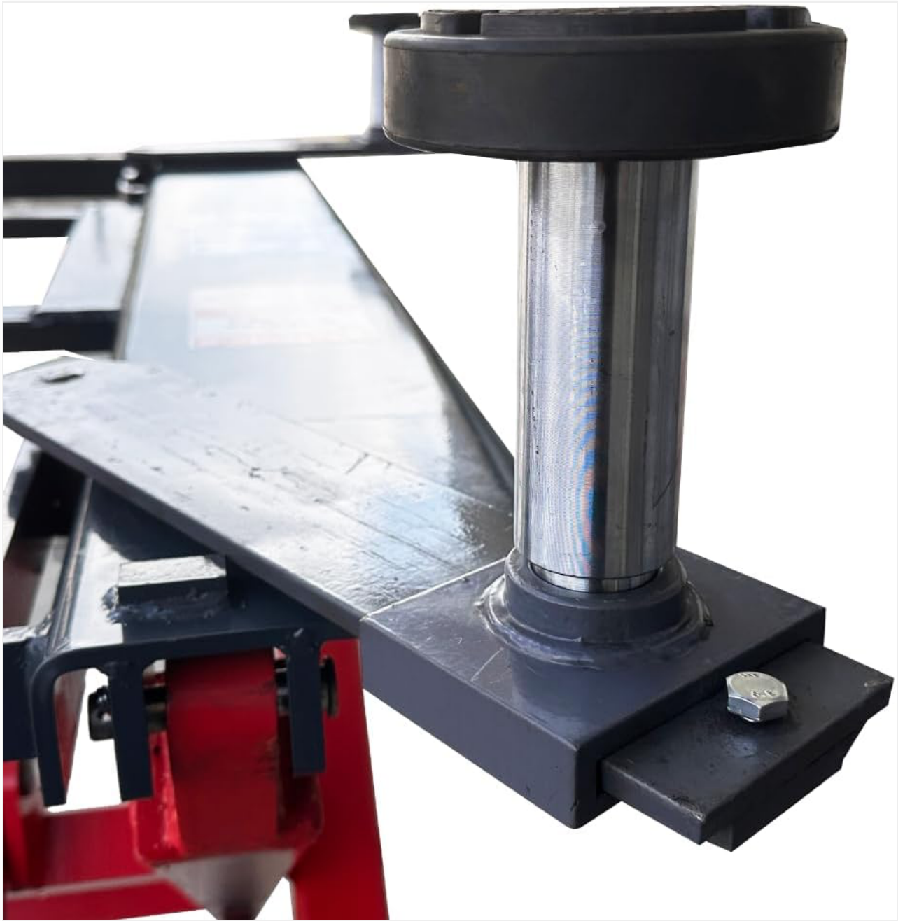
Figure 5.2: Detail of an adjustable lift pad, designed to accommodate various vehicle lifting points.