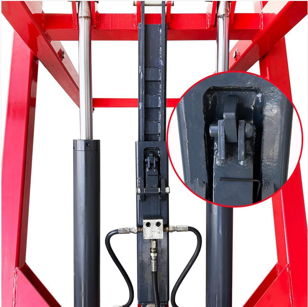
Figure 6.1: Detail of the mechanical safety locking mechanism, crucial for securing the lift at desired heights.