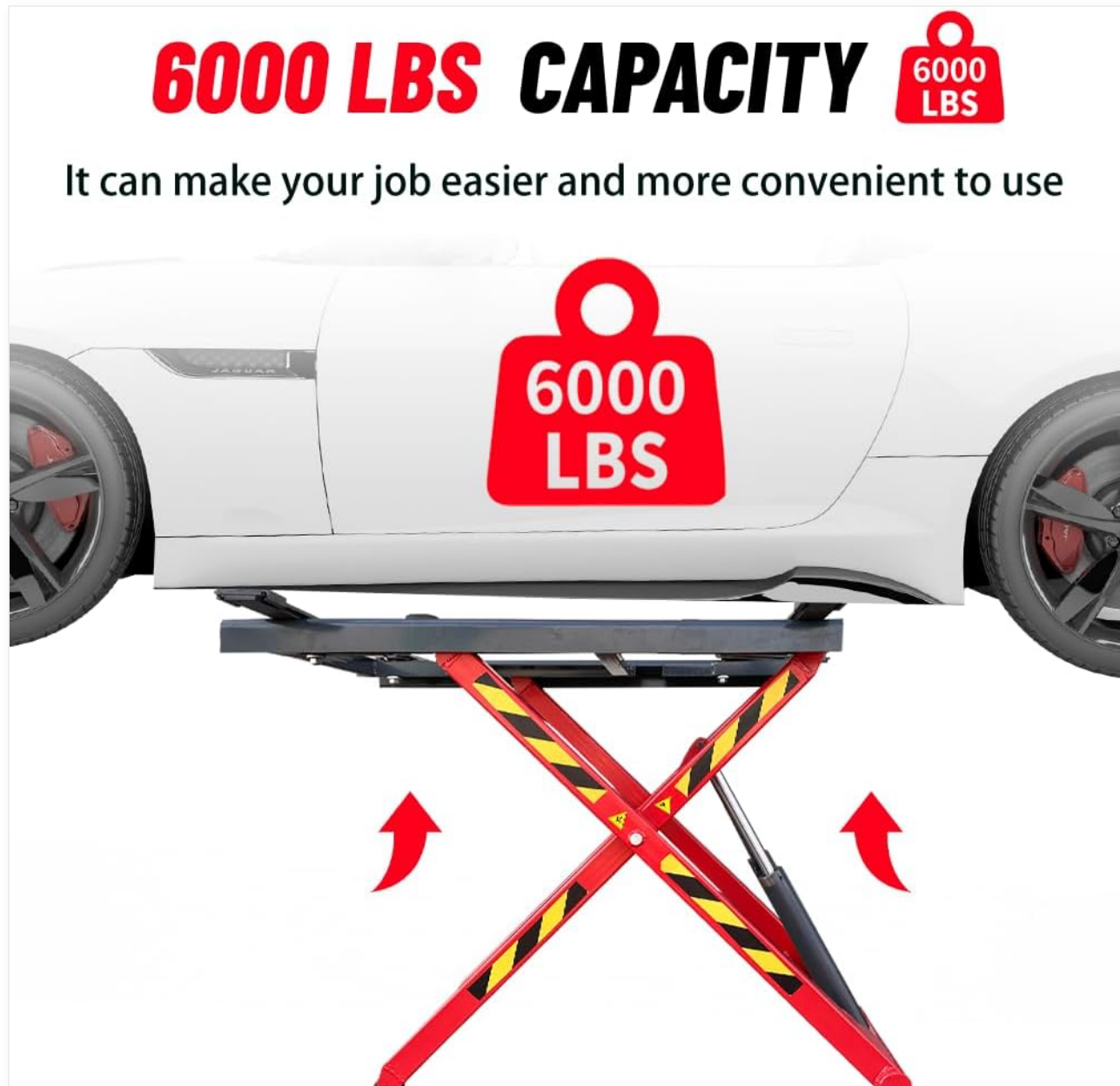
Figure 4.2: The KATOOL AK-X66 Scissor Lift supporting a vehicle, highlighting its 6000 LBS lifting capacity.