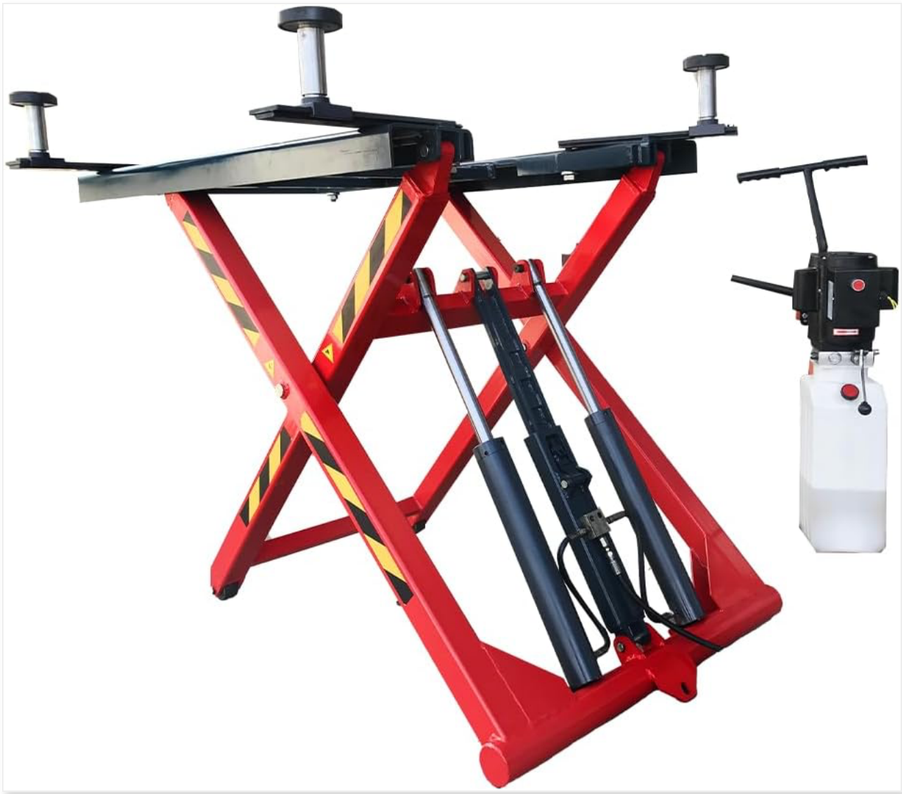
Figure 3.1: Main components of the KATOOL AK-X66 Scissor Lift, including the lift frame and separate hydraulic power unit.