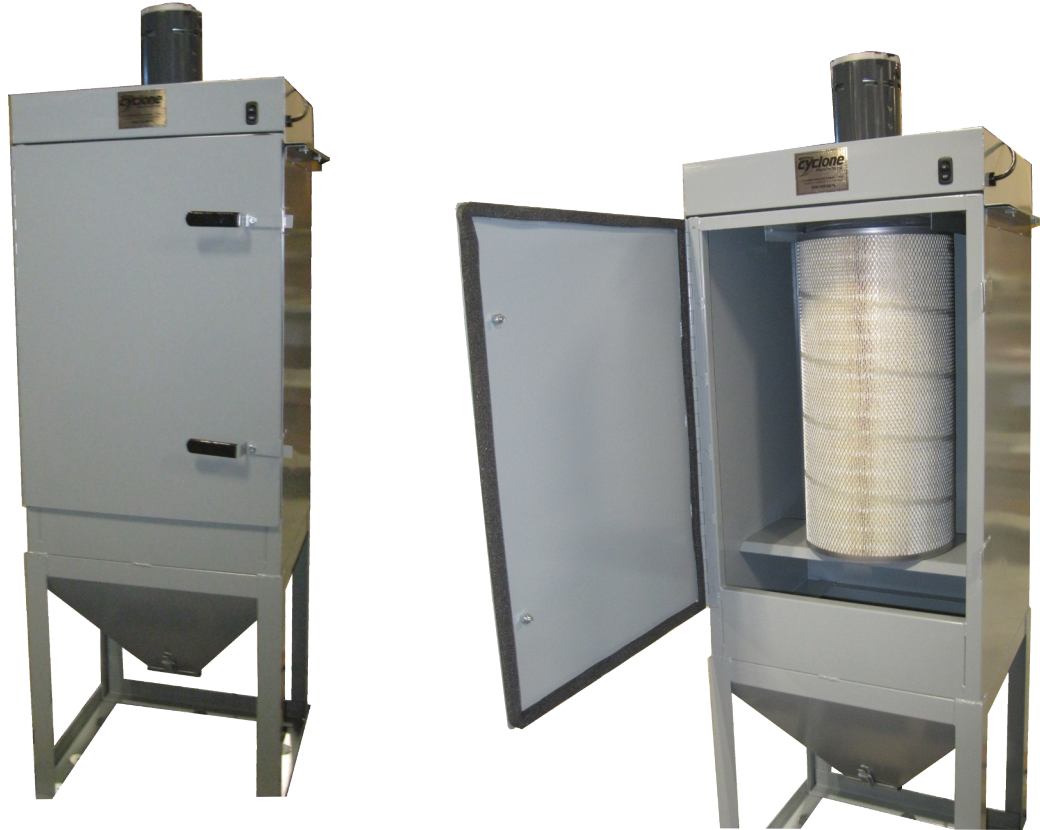
DC-4000 DOOR CLOSED, NOTE LATCHES SECURELY TIGHTENED.

Connect the DC4000 system to the blast cabinet using the 2.5" vac hose provided. There is one port for 2.5" hose that is open, and one port for a 5" hose (capped off). A 5" hose, if desired, must be purchased separately. If using a 5" vac hose, be sure to cap off the 2.5" vac port. A 5" hose will extract interior cabinet air, dust and debris faster than the 2.5" hose.