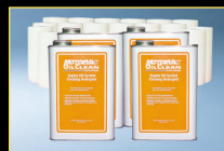
STANDARD KIT 4-ONE GALLON CONTAINERS 32 FILTERS Part No. 200-1027