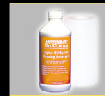
STANDARD KIT (SINGLE USE) 12-14 OZ. BOTTLES 12 FILTERS Part No. 200-1026