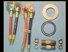
SPIN-ON ADAPTER KIT (STANDARD) Part No. 200-3112